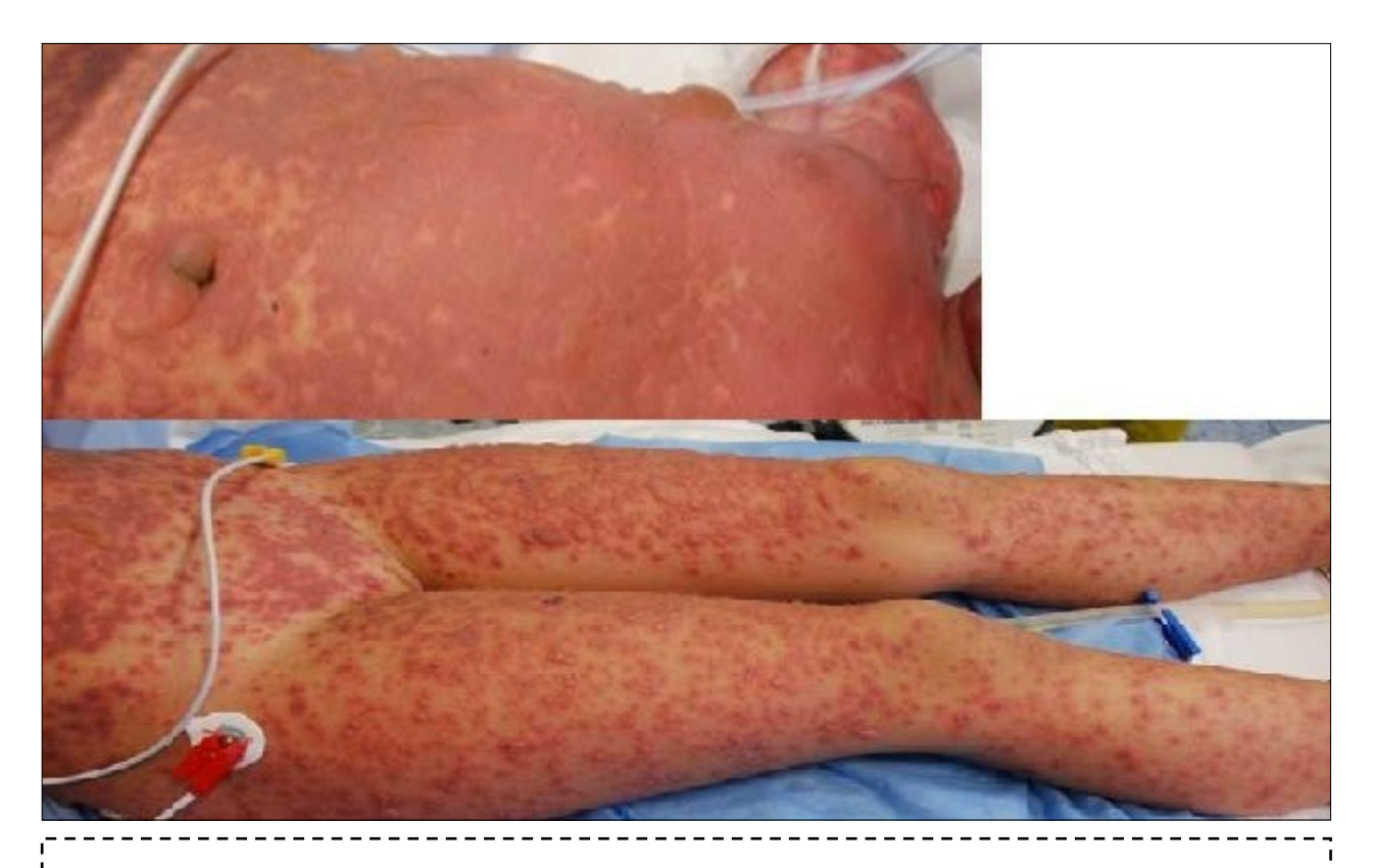
Figure 1. Emergency care of Lyell onset. Skin lesions were involving 100% TBSA. Here we see the typical aspect at trunk and arms level.