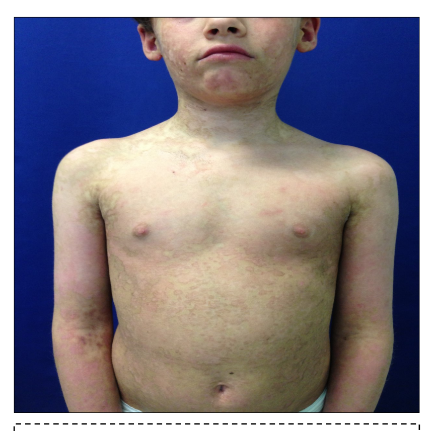
Figure 5. Six months follow up . Here we note trunk and neck with no scar evidence. Skin hyperemia and dyschromia are still present but with satisfactory cosmetic result and progressive regression.