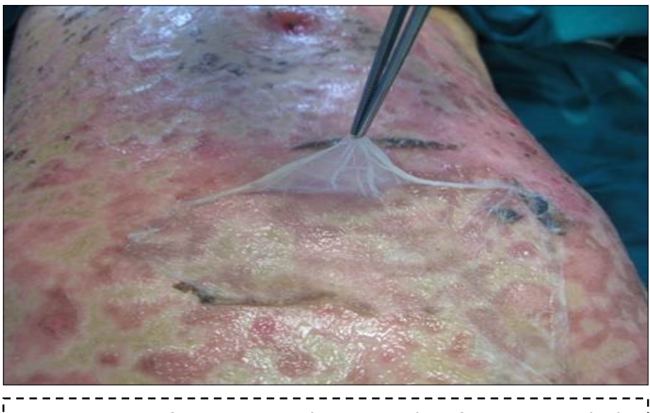
Figure 4. Aspect of Amniotic Membrane at 7 day after surgery with skin healing. A part of AM was retain for histological consideration.

Figure 3. Typical aspect of eye damage in Lyell syndrome. Please note application of Amniotic Membrane surrounding that area and it was also applied for eye restoration.