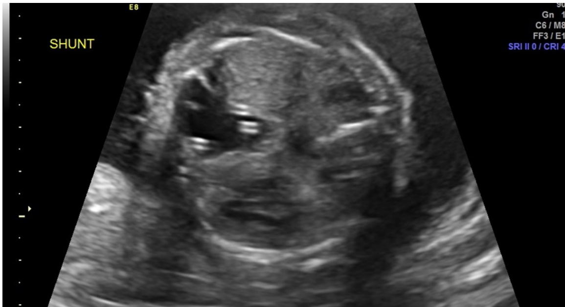
Figure 2. Two thoraco-amniotic shunts can be seen in the dominant CPAM cyst