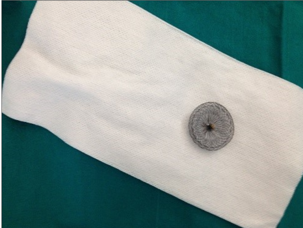
Fig.2 - Nitinol occluder system (Amplatzer®)