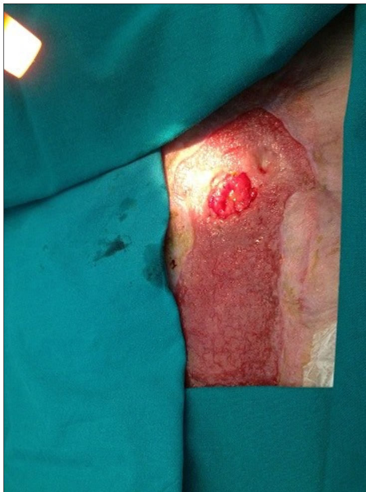
Fig. 3 - Enteroatmospheric fistula