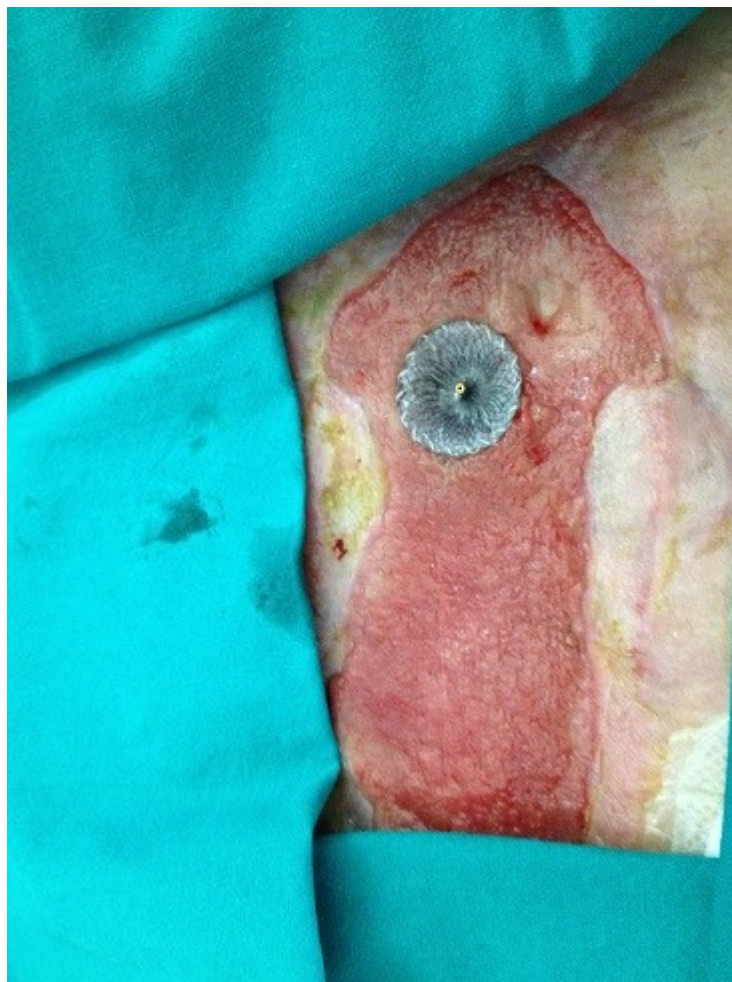
Fig. 4. Enteroatmospheric fistula with cardiac septal occluder

Finally the patient was discharged with a