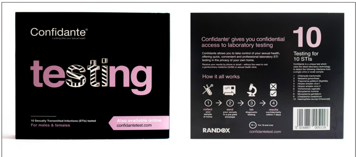
Figure 1. Confidante® STI testing kit