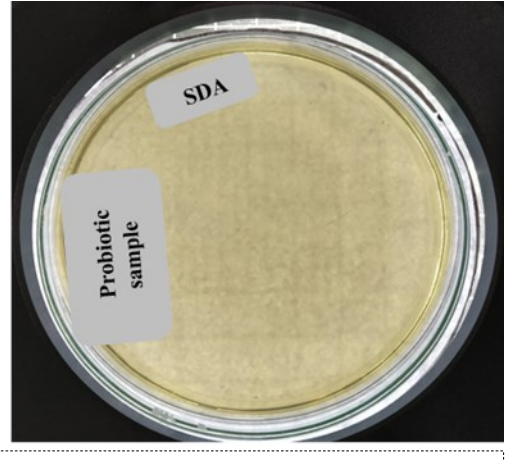
Figure 3. Probiotic supplements 1 in MacConkey (Mac) and Sabouraud Dextrose Agar (SDA) medium.