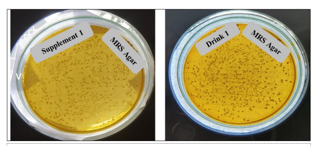
Figure 1. Representative Lactobacillus colony of Supplement 1 and Drink 1 in MRS Agar Media

In the case of five probiotic supplements, four were labeled with their respective Lactobacillus strain and colony as per IPA guidelines. However, supplement 5 didn't follow any of it. Probiotic bacteria need to be alive and present in large quantities to provide health benefits; this concentration is typically 10^6 – 10^7 cfu/g of the product (25). In the stated labeling they claimed that the probiotic supplements