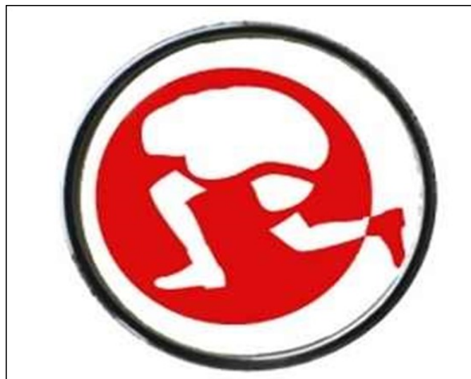
Figure 2. Beneficial implications to activate the brain

activity which easily can cause the brain to release hormones such as endorphins which decreases mental stresses and improves mind effectiveness. Further, walking activity as enhances the oxygen supply in brain space, promotes optimal brain workouts [5]. Likewise, listening to a desirable sound of music will advocate the center of attentions [6]. More importantly, good nutrients consumptions and drinking enough water strengthen the brain cells for more powerful performances at any tasks or movements at each day [7] (Fig2).